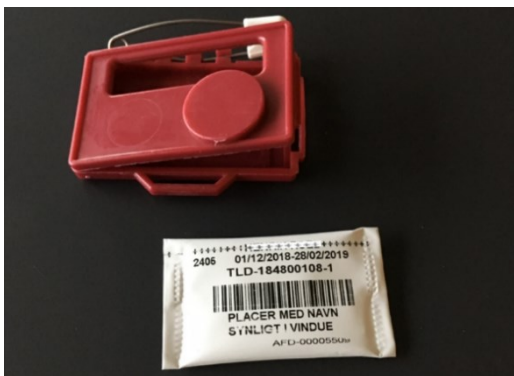
Figure 1. Plastic holder and dosimeter card (the whole body personal dosimeter).

The dosimeter can measure radiation doses caused by ionising radiation (X-rays, gamma and beta radiation). Doses are determined by the dose equivalents H_p(10) and H_p(0,07) , which are used as measures of effective dose and skin dose, respectively. Doses are expressed in mSv (millisievert). The whole body personal dosimeter consists of a metal card containing radiation sensitive thermoluminescent material. The metal card is wrapped in a special foil and a plastic holder in which the card is to be placed during use (see figure 1). The holder contains different filters that make it possible to measure the doses received by the wearer.