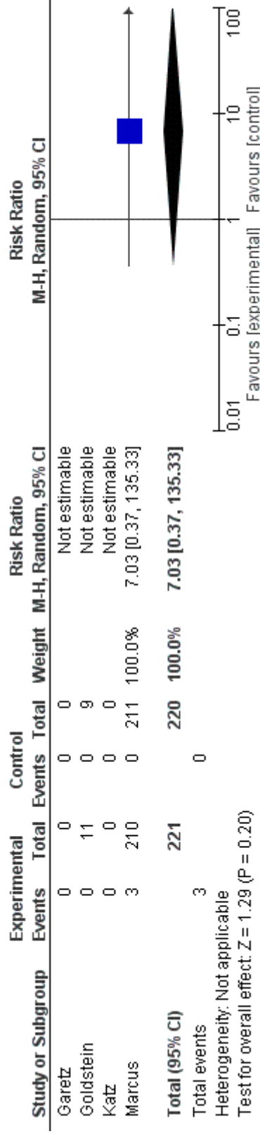
Figure 1 (Analysis 1.1)

Forest plot of comparison: 1 tonsillectomi vs no surgery, outcome: 1.1 haemroage.